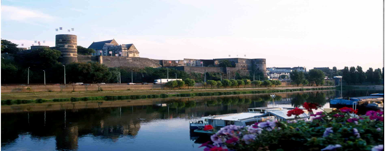
The château of Angers

Going to study in Angers? This guide will help facilitate your arrival in Angers and make your stay as enjoyable as possible.